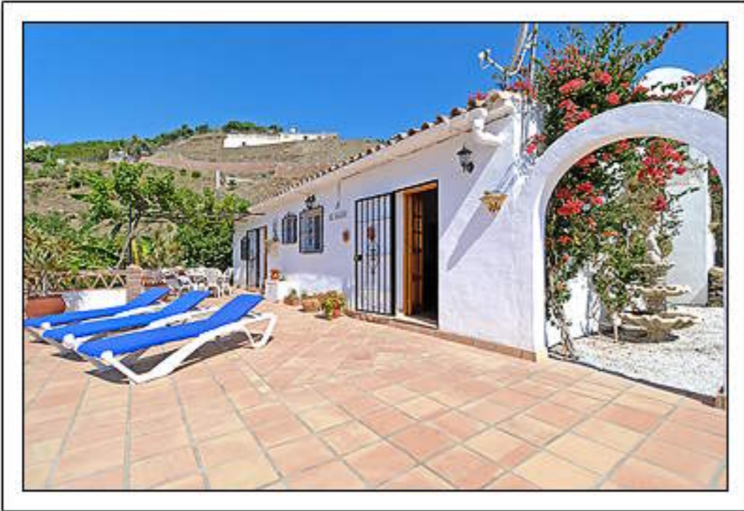
Large Terrace & Dining Area