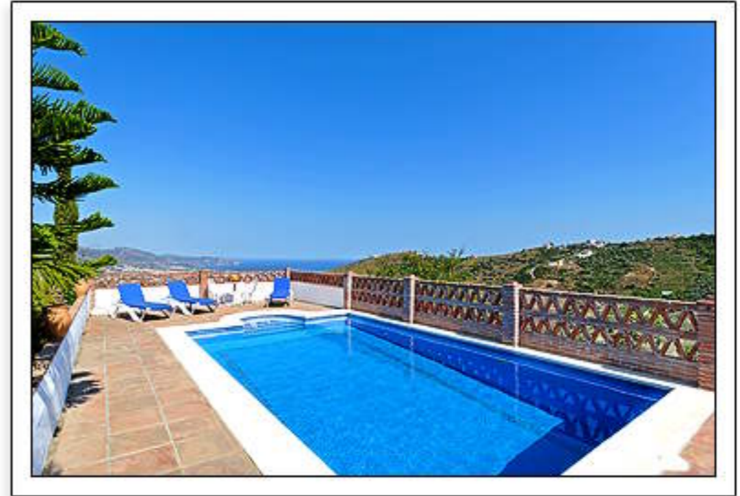
Heated Pool With Stunning Sea & Mountain Views