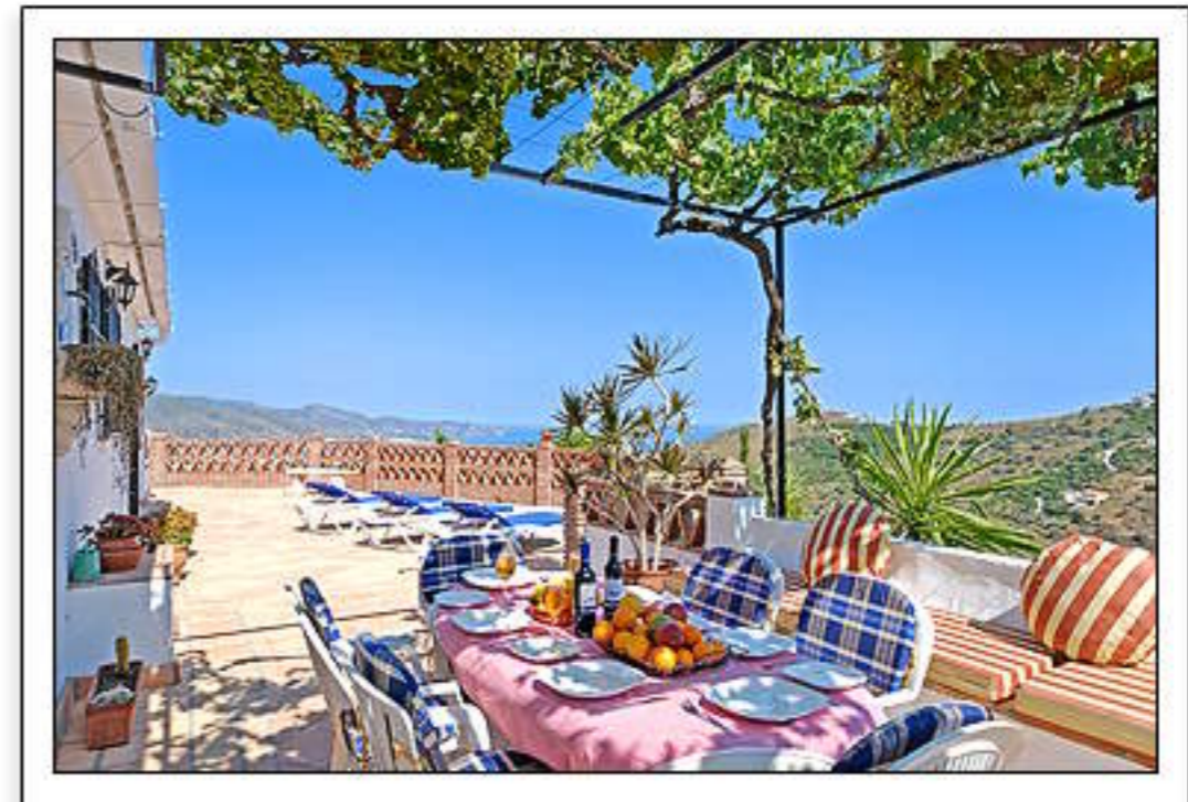
Large Terrace For Dining & Relaxing