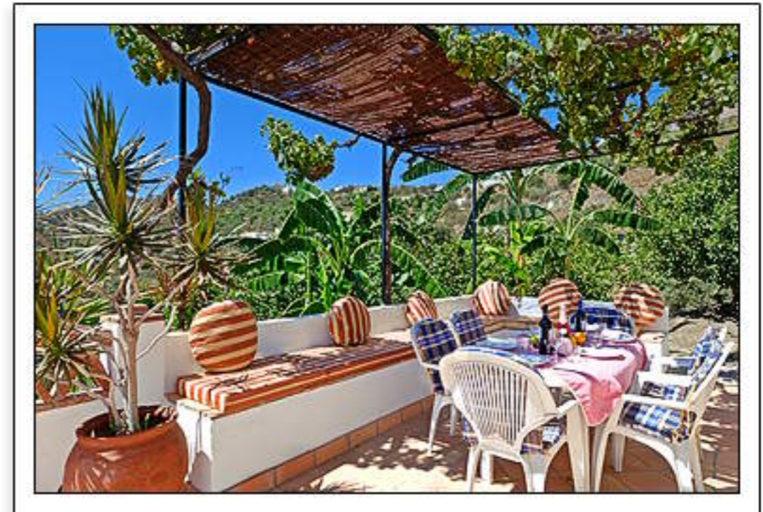
Dining Outside On The Terrace Under The Shade