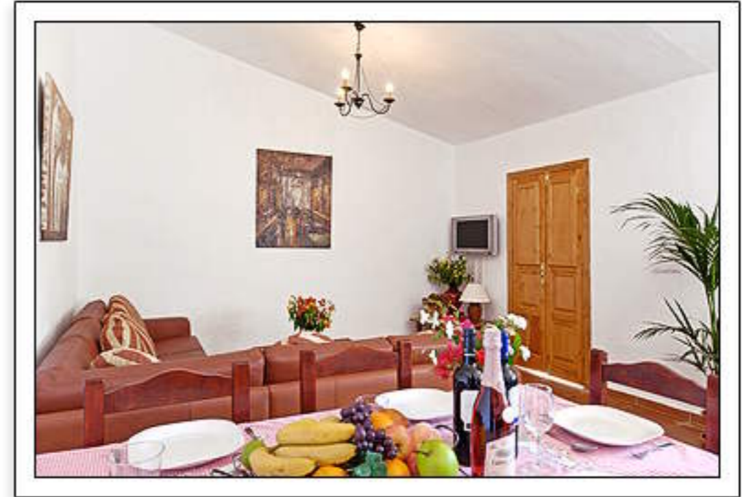
Open Plan Lounge, Kitchen & Dining Area With Doors Leading To Terrace